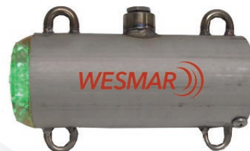
Trawl light inside of its stainless steel carrier – ready to mount.

WESMAR knows about the challenges of weight and size because of our catch sensors, considered the most rugged in the industry, yet the lightest of weight. Using this knowledge we designed a trawl light that slips into a WESMAR stainless steel carrier. They attach to the net and are lit with a long-life battery.