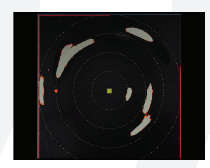
Sonar view spotlighting icebergs surrounding vessel