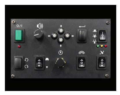
Main control panel