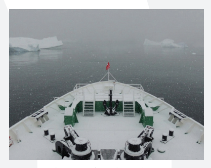
Research vessel with icebergs in forward view.

The EV860 is equipped with a very robust hydraulic hoist that deploys or retracts the soundome in just 5 seconds.