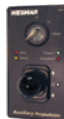
APU Propulsions Controls