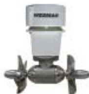
DC Pro Thrusters

WESMAR also manufactures a full line of Searchlight sonar, Trawl sonar, Bow and Stern Thrusters for yachts and sportfishing, and Auxiliary Propulsion (Get-Home) System.