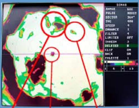
Bait Fish Boat Marlin

Locate bait and game fish 360 degrees around the boat!