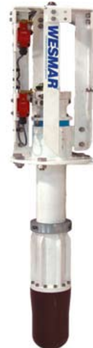
Hydraulic Hoist & Soundome Assembly

The SS395 is available in three frequencies, each with a standard electric hoist or optional long stroke hydraulic hoist. All hoist systems are designed to fit a one meter seachest unless otherwise specified.