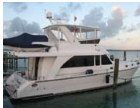
The M/Y Pretty Penny