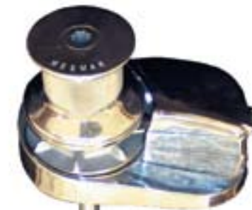
WESMAR's Stainless Steel Anchor Windlass

WESMAR has introduced the new WM3500 Stainless Steel Vertical Anchor Windlass. The WESMAR Anchor Windlass addresses anchoring,