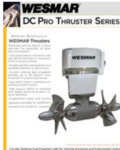
WESMAR's New DC Pro Thruster Brochure