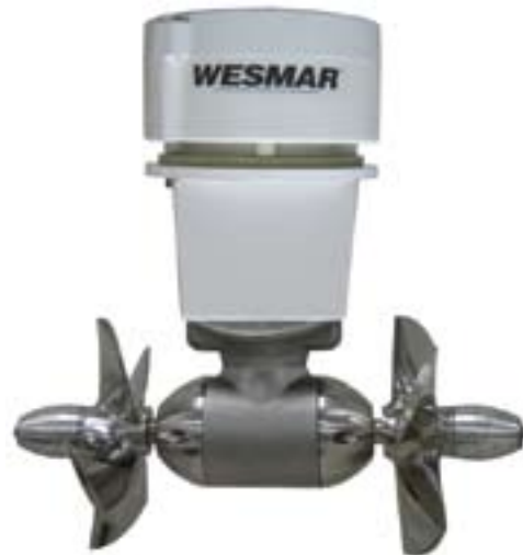
WESMAR's stainless steel dual prop DC Pro Thruster

with a dramatic new design that increases power from 8 to 13 horse power. Now, thanks to the new high