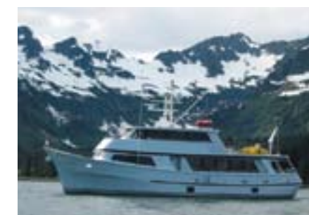
The 75-foot, MV Jamal was featured in this month's Hatteras Mailing.

It is no secret that reaching the end user with a direct mail piece, relevant to their needs, is the most powerful type of advertising. WESMAR has